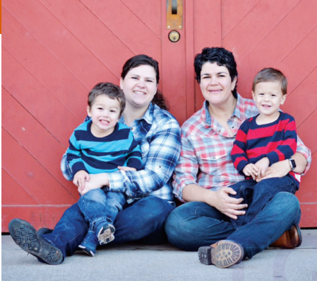
The Baumbach Family